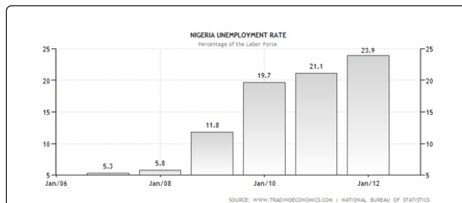
Figure 2: Nigeria's Unemployment Rate.

Of course youth unemployment is a not a phenomenon exclusive to Nigeria or Sub-Saharan Africa as many developed countries, are plagued by high youth unemployment rates with the recent global economic downturn. However, if countries like Nigeria are to avert a demographic disaster already incubating a lost generation vulnerable to drug addiction, militancy, insurgency and general disillusionment, then it is imperative that this youthful population is productively engaged. There are indeed factors responsible for this cankerworm in the system – the employment problem [6].